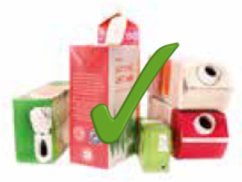
Milk, juice and soup cartons